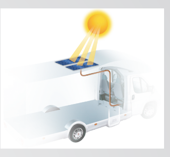
120W Solar Panel Fitted solar panel provides additional power allowing greater outdoor freedom