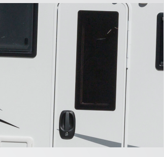
UK Habitiation Door Living space door with window, bin and blind