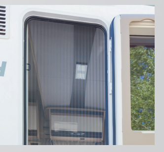
Entrance Door Pleated sliding mosquito net on entrance door. External LED light over the entrance door

For more Information Please visit: www.mclouisfusion.co.uk