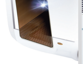
Garage with 300kg weight limit and LED Lighting