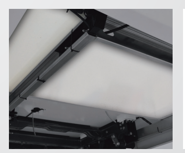
Fibreglass Underbody Maximum resistance against water and atmospheric agents.