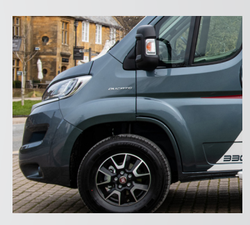
Colour Bumper Front bumper in white and integrated daylights