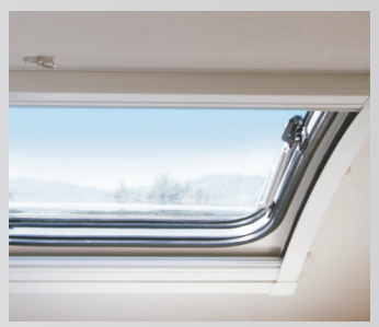
Sky Dome Window Opening skydome with blind