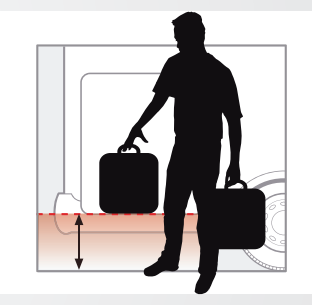
Lowered Garage Doors for more comfortable loading (model specific)