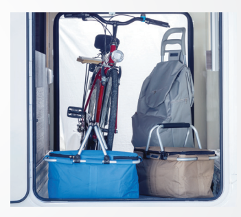
Wide Garage Doors Internal garage height up to 1470 mm (model specific)